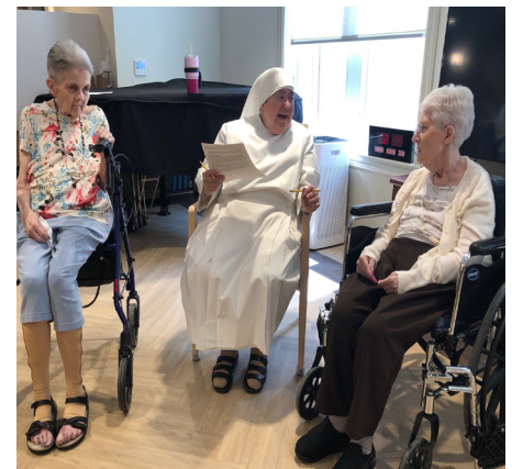
Residents watched a presentation on St. Jeanne Jugan, foundress of the Little Sisters of the Poor and then competed in a crossword puzzle game.