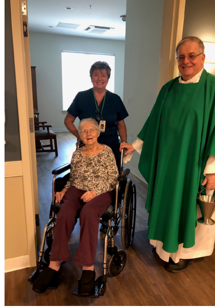
Residents eagerly and excitedly processed to the new building after Mass on August 17 for the blessing of the unit and for their first glimpse of the new health center. A week later they processed back to the new building for the ribbon cutting and to move in.