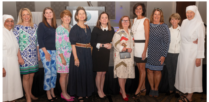
The Board of St. Francis were also honorees at the Gala. Their members form an auxiliary group that fundraises for the needs of the Home. They provided wardrobes, dressers, and nightstands for the new health care rooms.