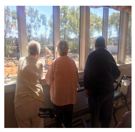
Every day after lunch, these three Residents go to the dining room windows to watch and check out the progress of the construction.