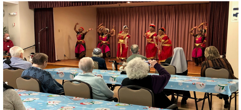
A February Winter Fest party, sponsored by AJJ Associates, helped chase the winter blues away. Indian dancers from the Matha Dance Academy, two young award winning Irish dancers, the Sisters and a DJ entertained our delighted Residents.