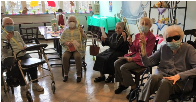
Residents and Sisters rejoiced in being able to gather together for Holy Week and Easter liturgies, beginning with Palm Sunday's blessing of the palms and procession from the Cappuccino Corner to the Chapel.

We also celebrate you, our supportive friends and benefactors. Your prayers and assistance have encouraged us and lifted our spirits and have helped provide our Residents with a warm and caring Home.